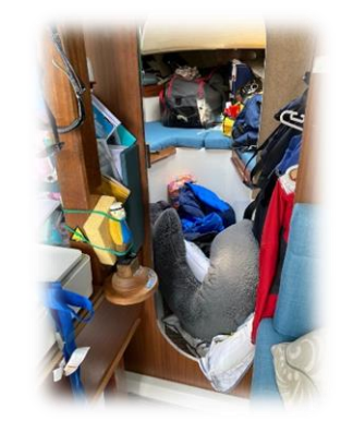
Figure 4: Eddy lashed to the beam for jumping ship in France but avoided the carnage of a rough passage.