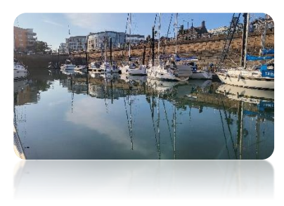
Figure 2: SWG in St Helier, Jersey