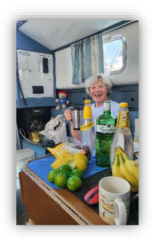
Figure 1: The SWG Chair victualling for ASC23